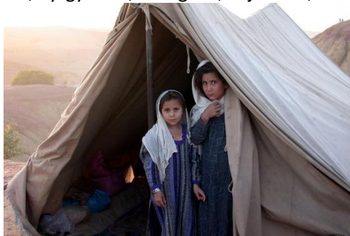
Ethnic Uzbek refugees from Afghanistan in the Shamshatoo refugee camp near Peshawar, Pakistan.

Afghanistan, Kazakhstan, Kyrgyzstan, Mongolia, Tajikistan, Turkmenistan, Uzbekistan