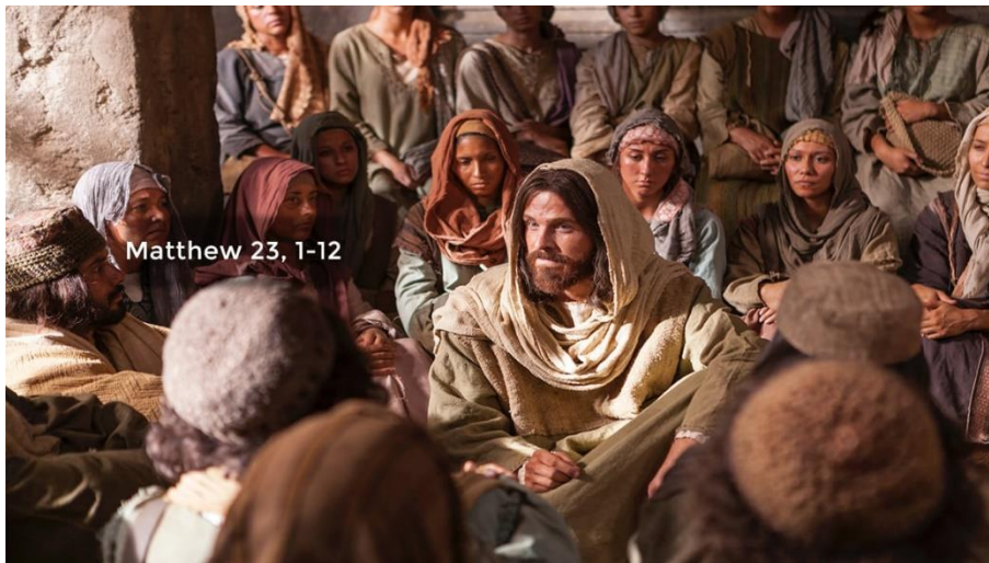
Matthew 23, 1-12

Then Jesus said to the crowds and to his disciples, 'The scribes and the Pharisees sit on Moses' seat; therefore, do whatever they teach you and follow it; but do not do as they do, for they do not practise what they teach. They tie up heavy burdens, hard to bear, and lay them on the shoulders of others; but they themselves are unwilling to lift a finger to move them. They do all their deeds to