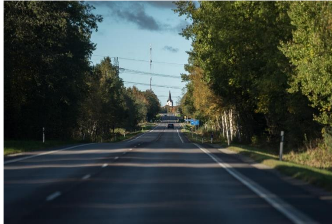
Toad towards Keila Church, the biggest medieval country church in Harju county in Estonia.