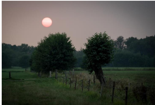
De Glind, Netherlands.