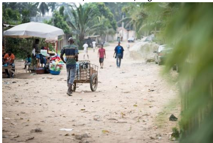
Attoban area, near Dora Ville, in Abidjan, Côte d'Ivoire.