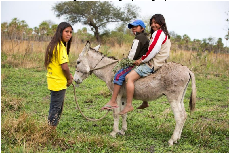
Children of the Sanapaná indigenous group on a donkey in Laguna Pato, Paraguay.