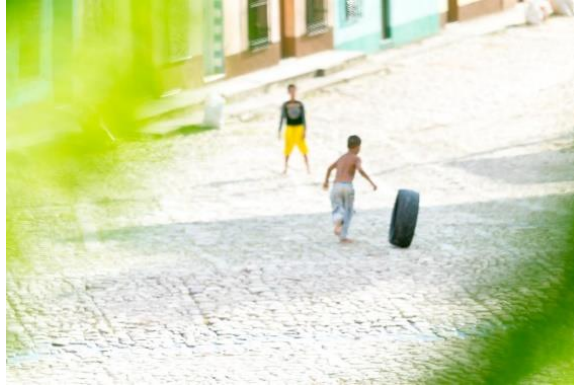
Children playing on the street of the colonial town of Trinidad, Cuba, listed as a UNESCO world heritage site.