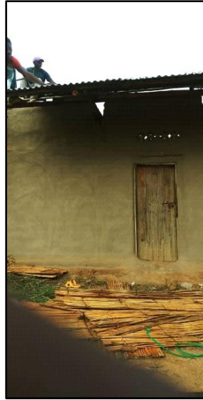
Working on the roof