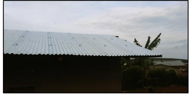
The finished roof.

We will continue to support her work with offerings in the envelopes provided at church or by direct deposit into the church account (details above), noting 'refugee support' on the envelope or deposit. It would be great if we could have another contribution by Christmas time.